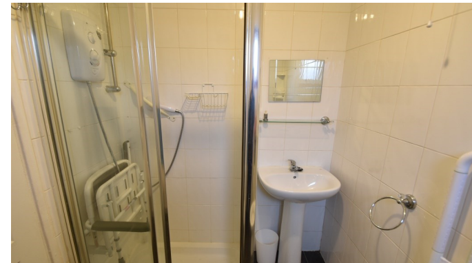
105 Nigel Rise