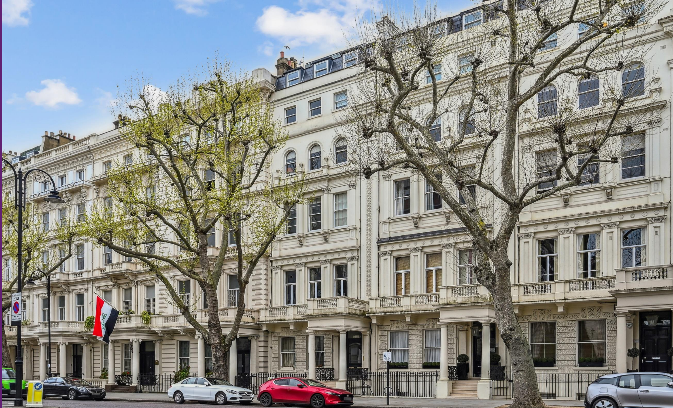
Queens Gate South Kensington, SW7