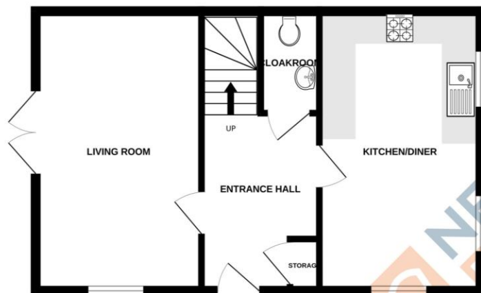
GROUND FLOOR 444 sq.ft. (41.3 sq.m.) approx.