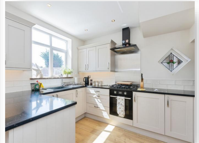
Hall Road, Scraptoft Leicester LE7 9SX