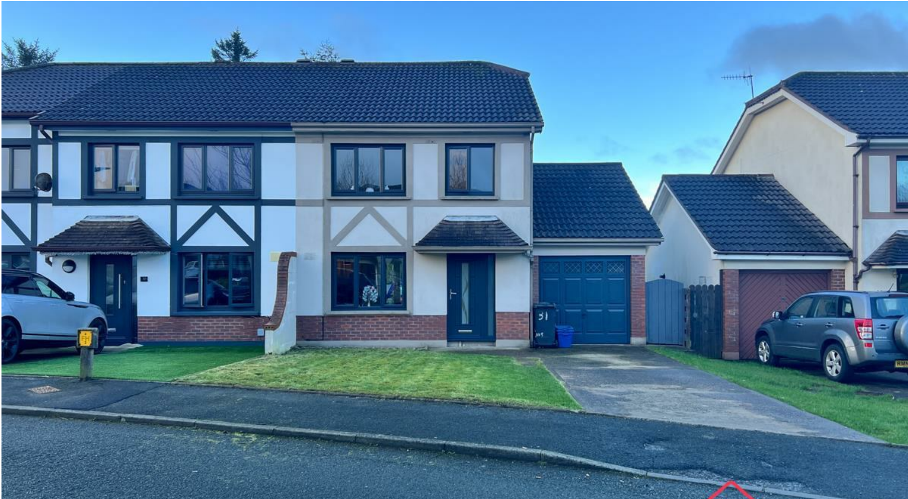
31 Farmhill Meadows, Douglas, Isle Of Man, IM2 2LJ Asking Price £395,000