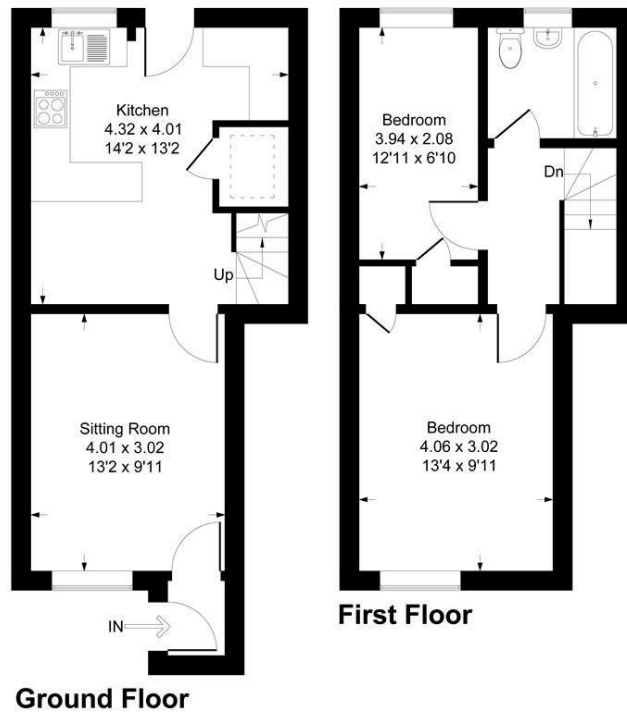
Illustration for identification purpose only, measurements approximate, and not to scale.