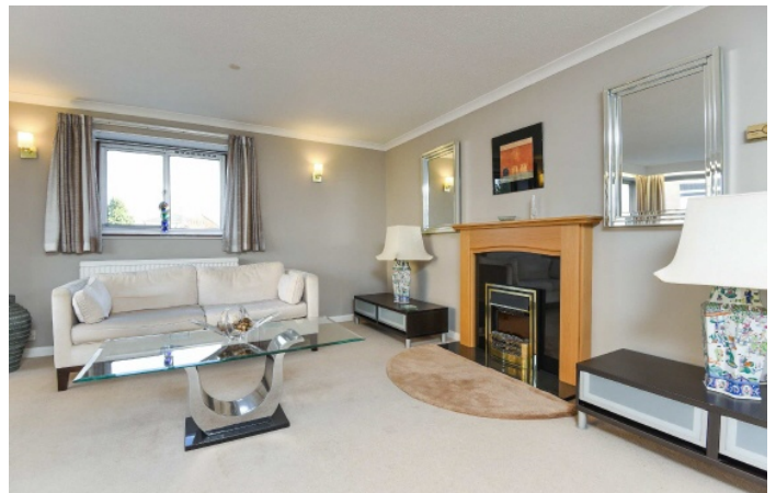
Portsmouth Road, KT6