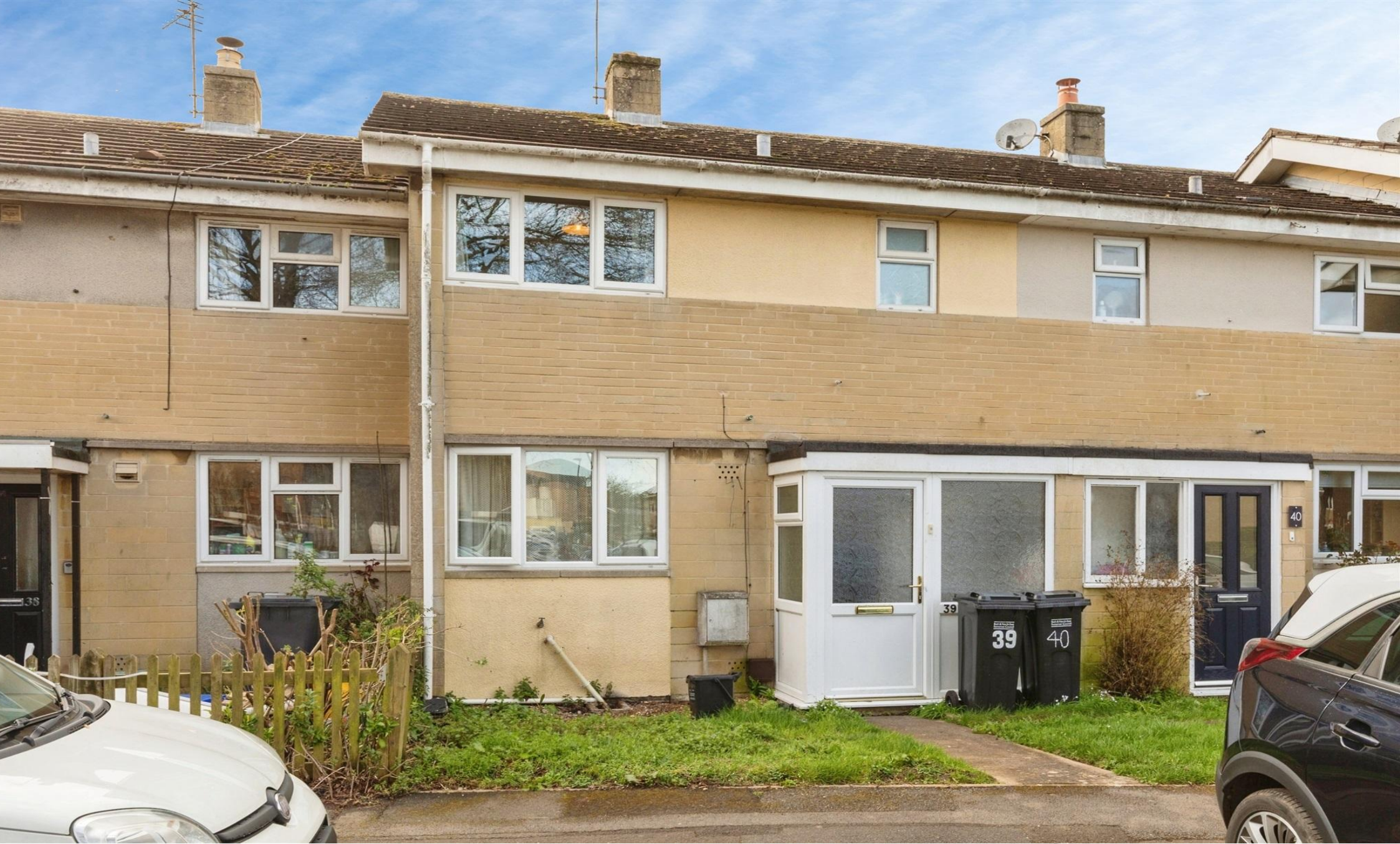
Bradford Park, Bath BA2 5PR