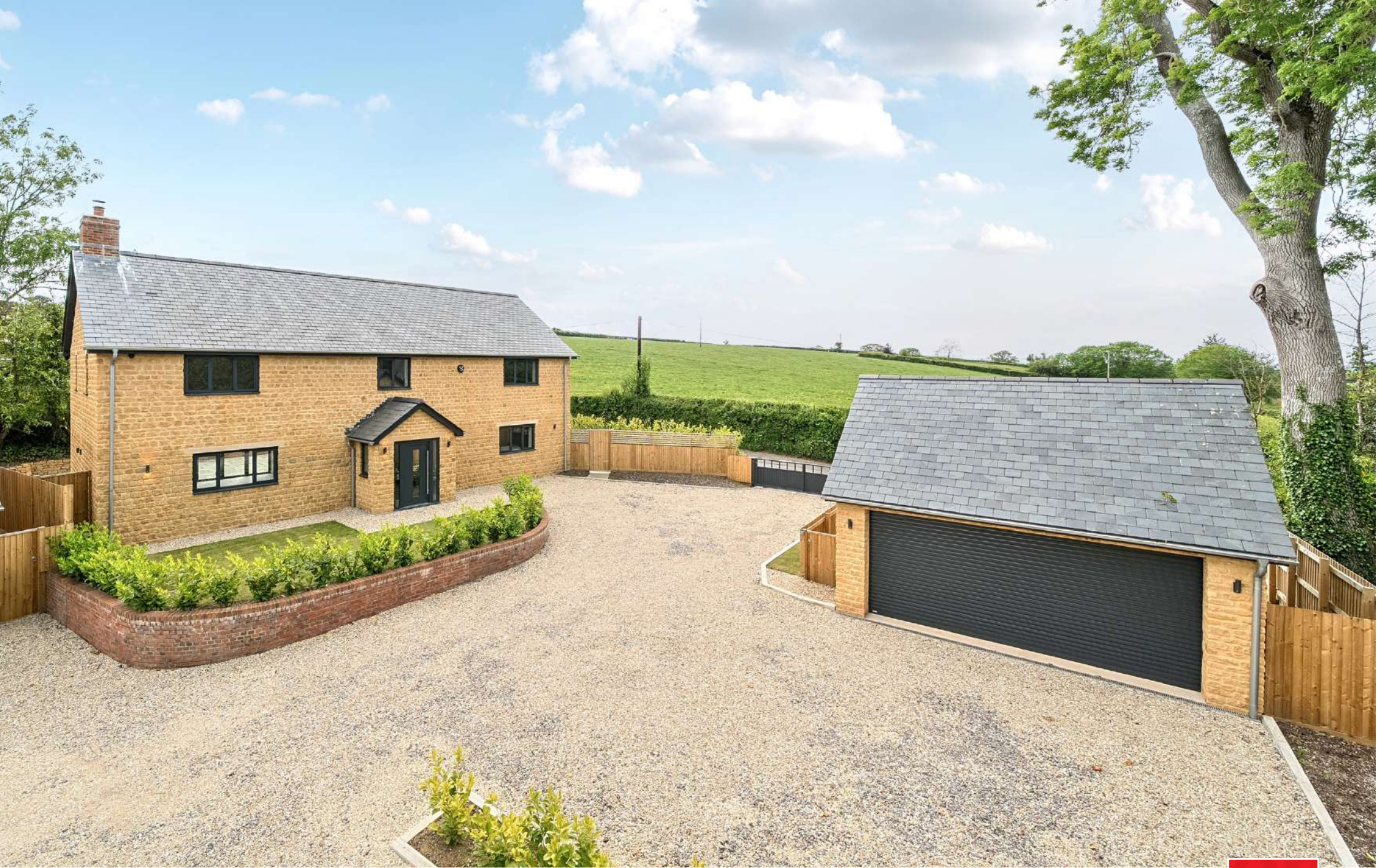
Chestnut House Broadstone Lane, Hardington Mandeville, Yeovil BA22 9PR