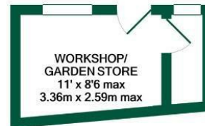
GROUND FLOOR APPROX. FLOOR AREA 642 SQ.FT. (59.7 SQ.M.)