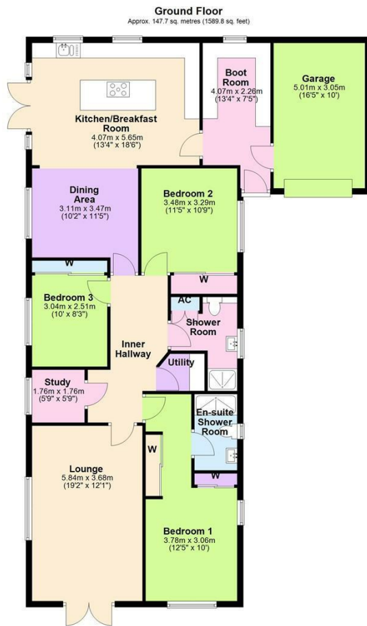
Total area: approx. 147.7 sq. metres (1589.8 sq. feet)