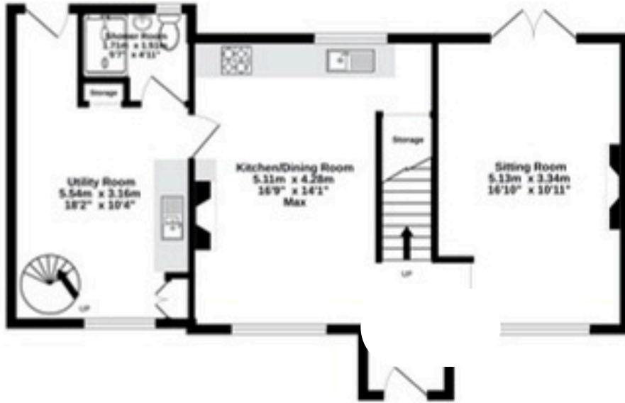
Ground Floor 57.6 sq.m. (620 sq.ft.) approx.