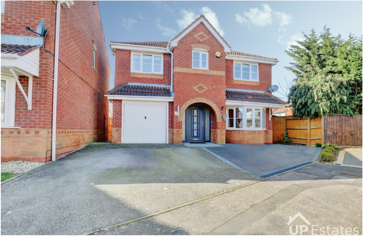
St. Buryan Close, Nuneaton