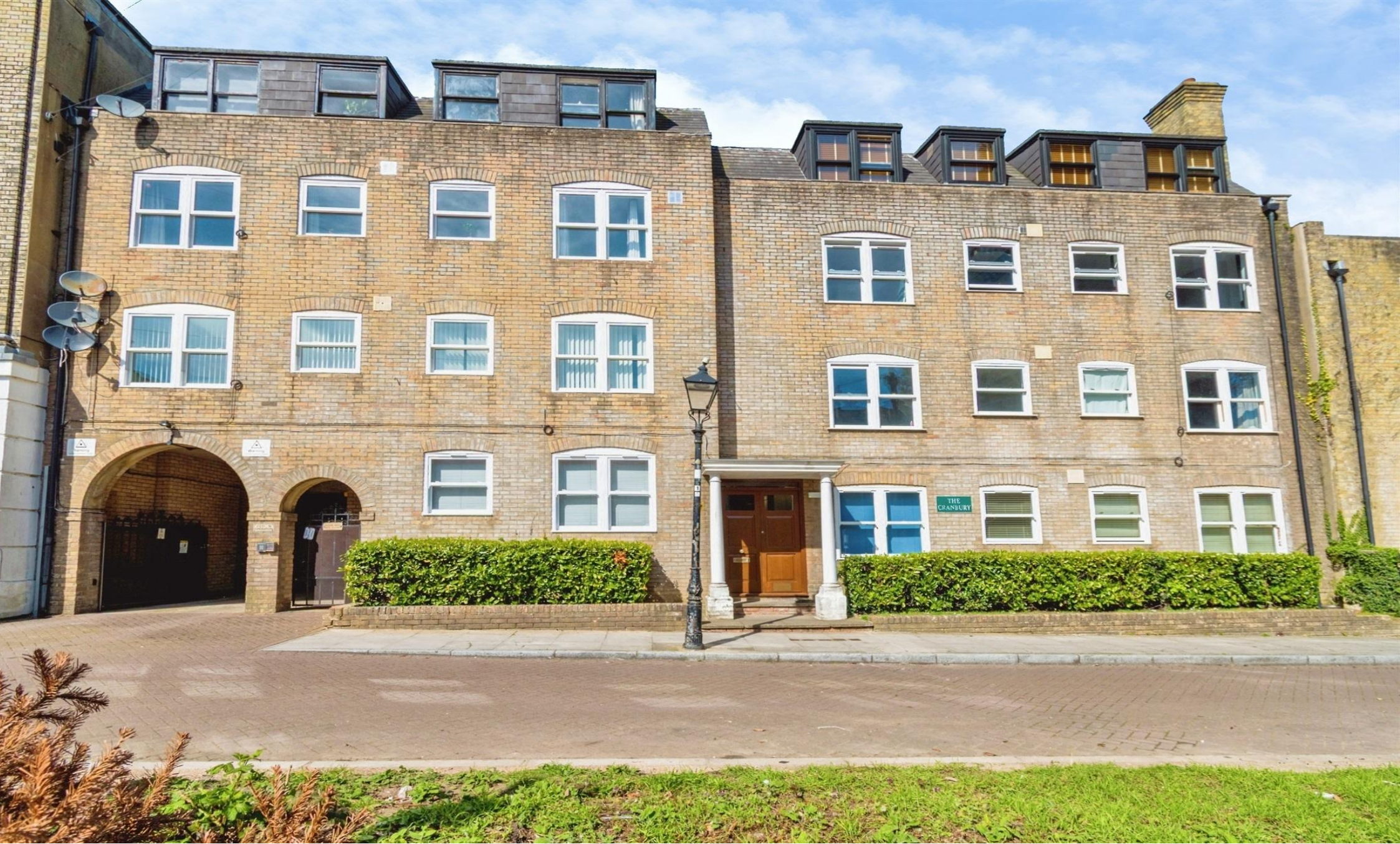
The Cranbury, Cranbury Terrace, SOUTHAMPTON SO14 0LH