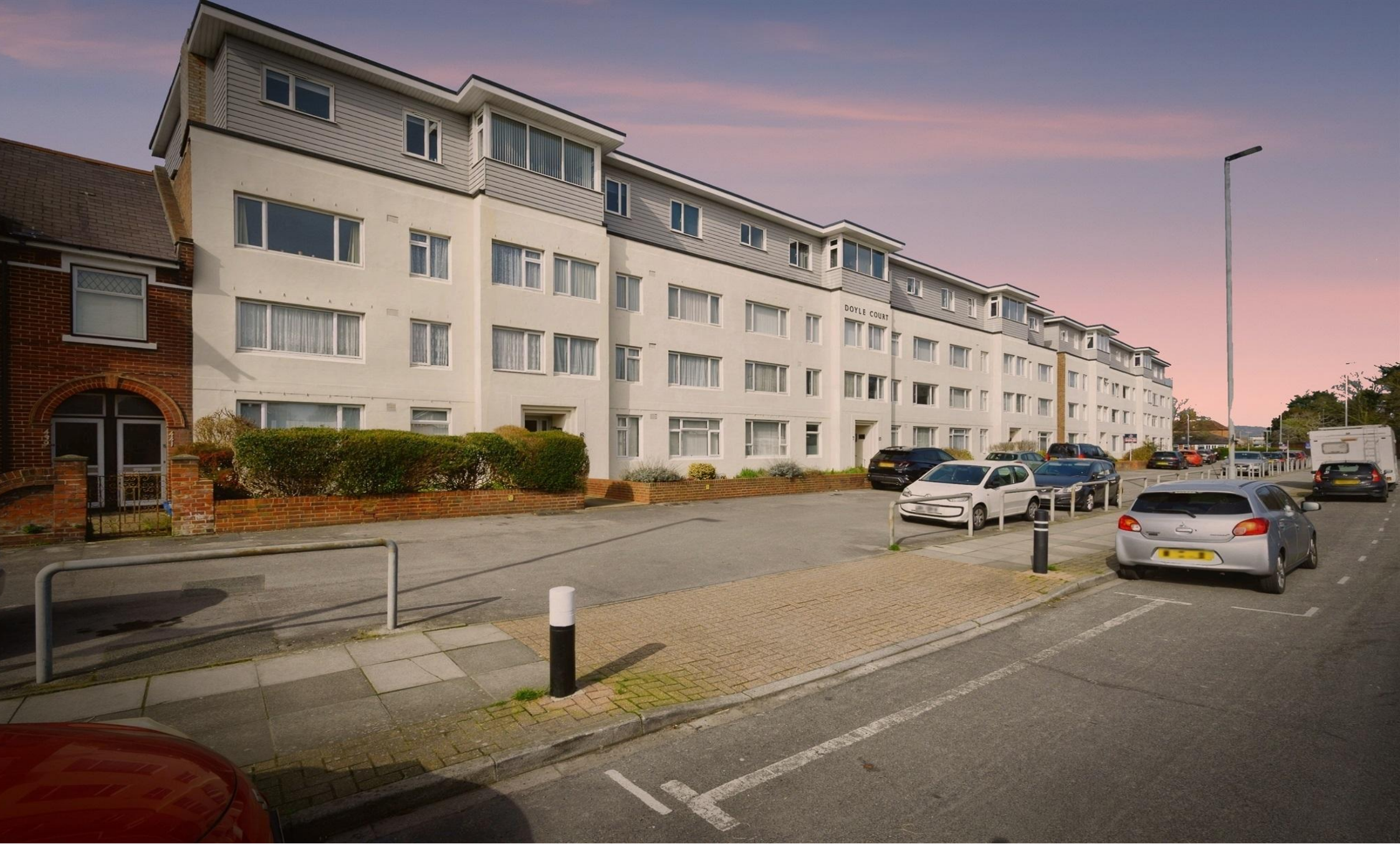
Doyle Court London Road, PORTSMOUTH PO2 9HP