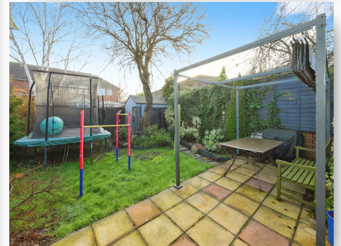
Queens Drive, Waltham Cross EN8 7PP