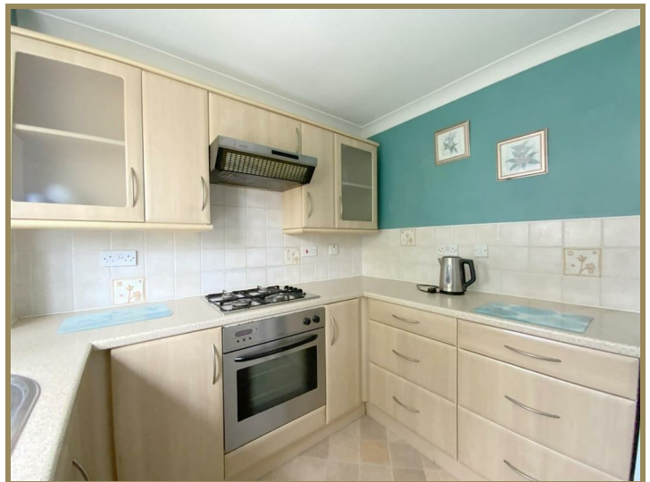
12 Deene Close, Grimsby, DN34 5XB £120,000