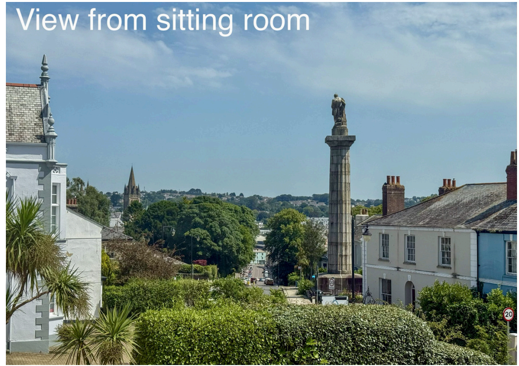
View from sitting room