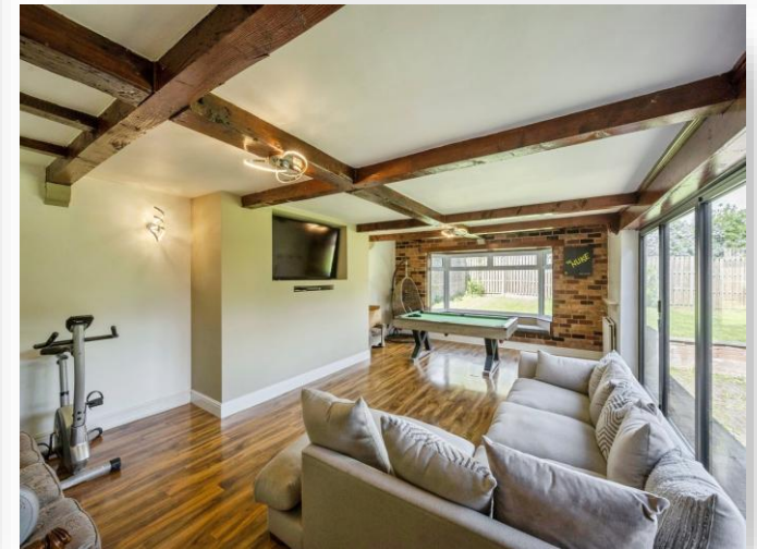
Sedgefield Way, Mexborough S64 0BE