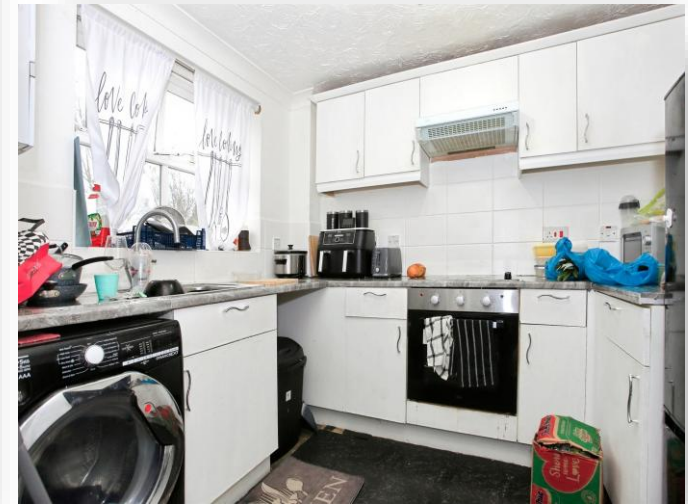
Honeysuckle Court, Peterborough , PE2 9JT