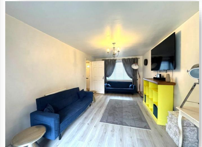
Starling Close, Shepshed