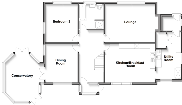
Ground Floor Approx. 1201.4 sq. feet