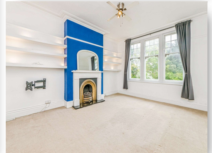
Pen-Y-Lan Road, Penylan Cardiff CF23 5RE