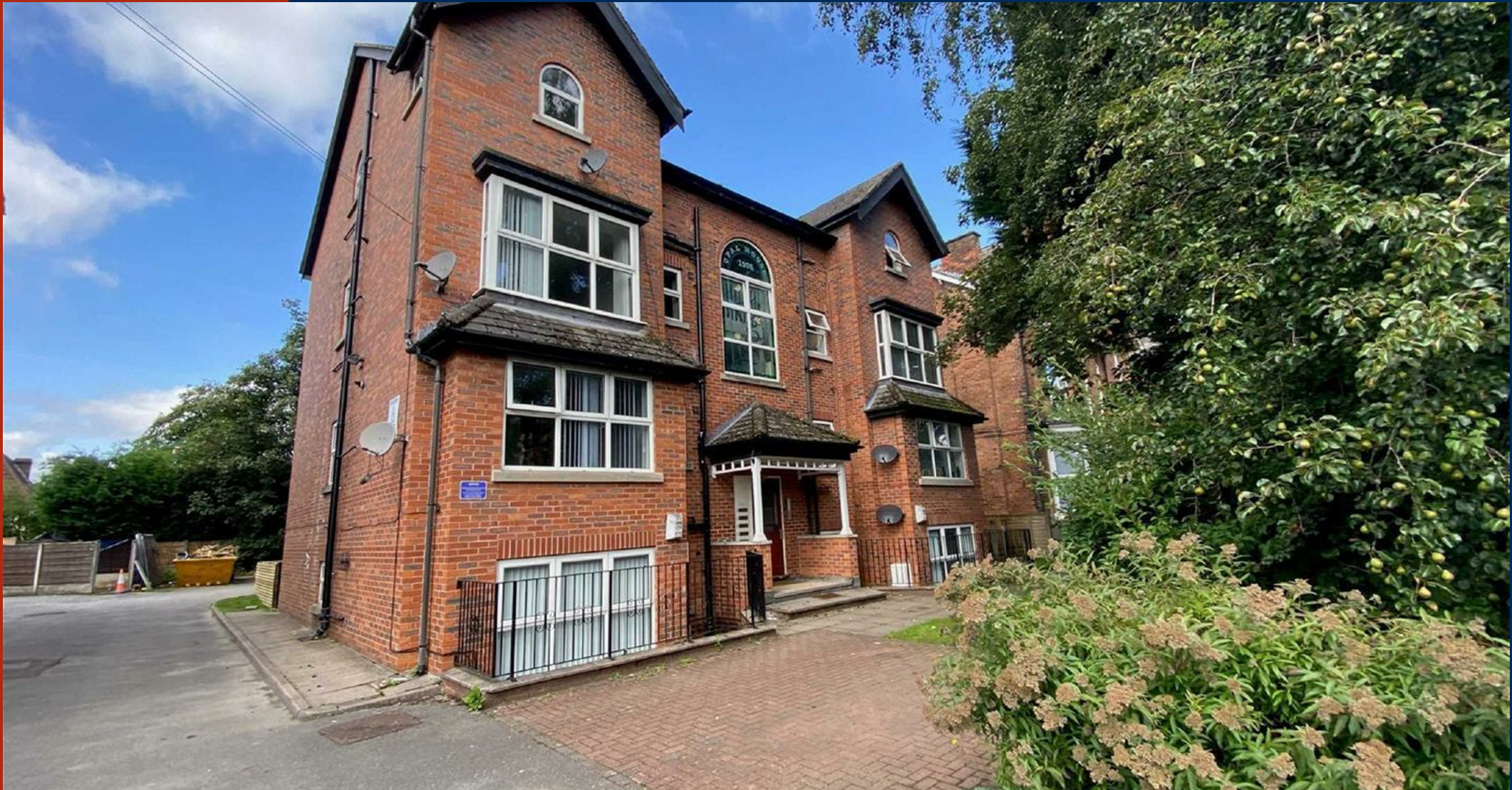
Opal House 11-13 Irlam Road, Sale, M33 2BH