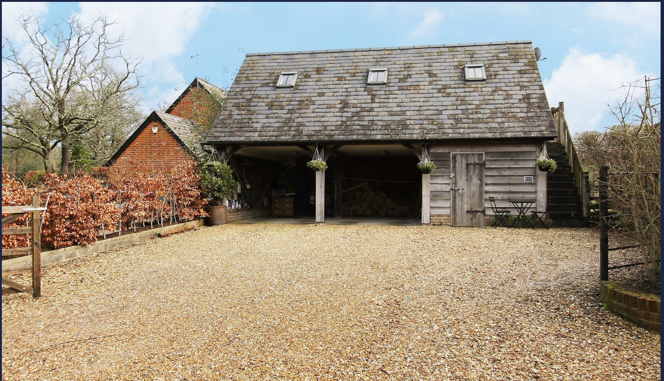
The Studio, Newport Barn, Newport Lane, Romsey