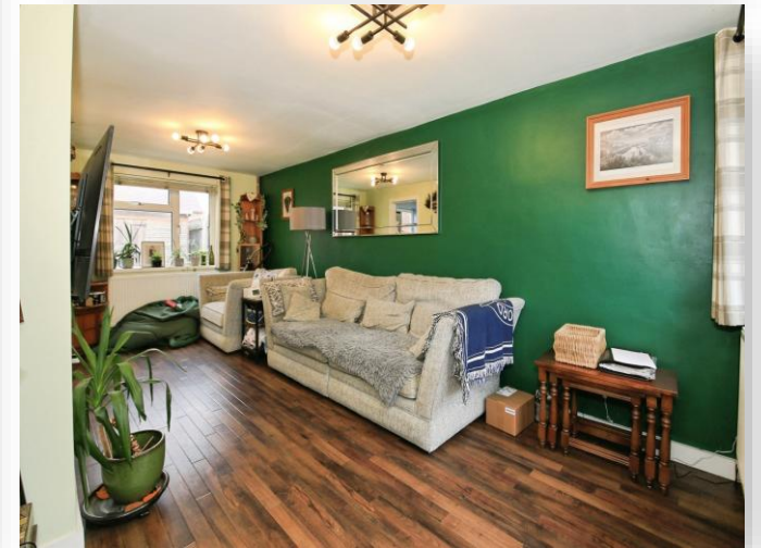
Conway Avenue, Peterborough PE4 6JD