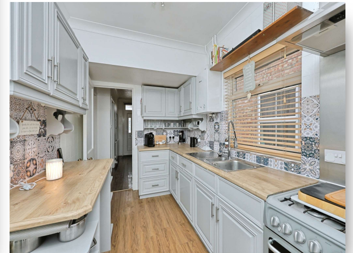
Crown Road, Dereham, NR20 4AE