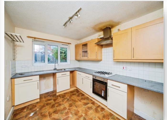
Lawnwood Drive, Goldthorpe Rotherham S63 9GB