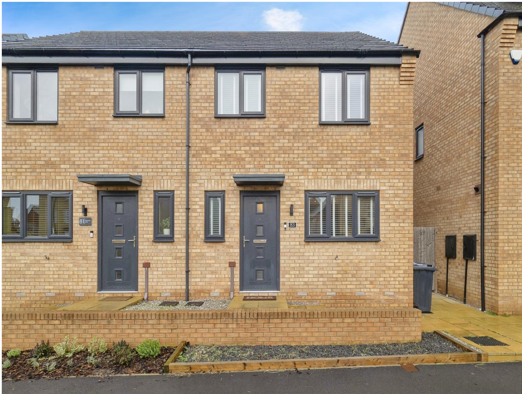
Richmond Lane, Kingswood, Hull, HU7 3JZ