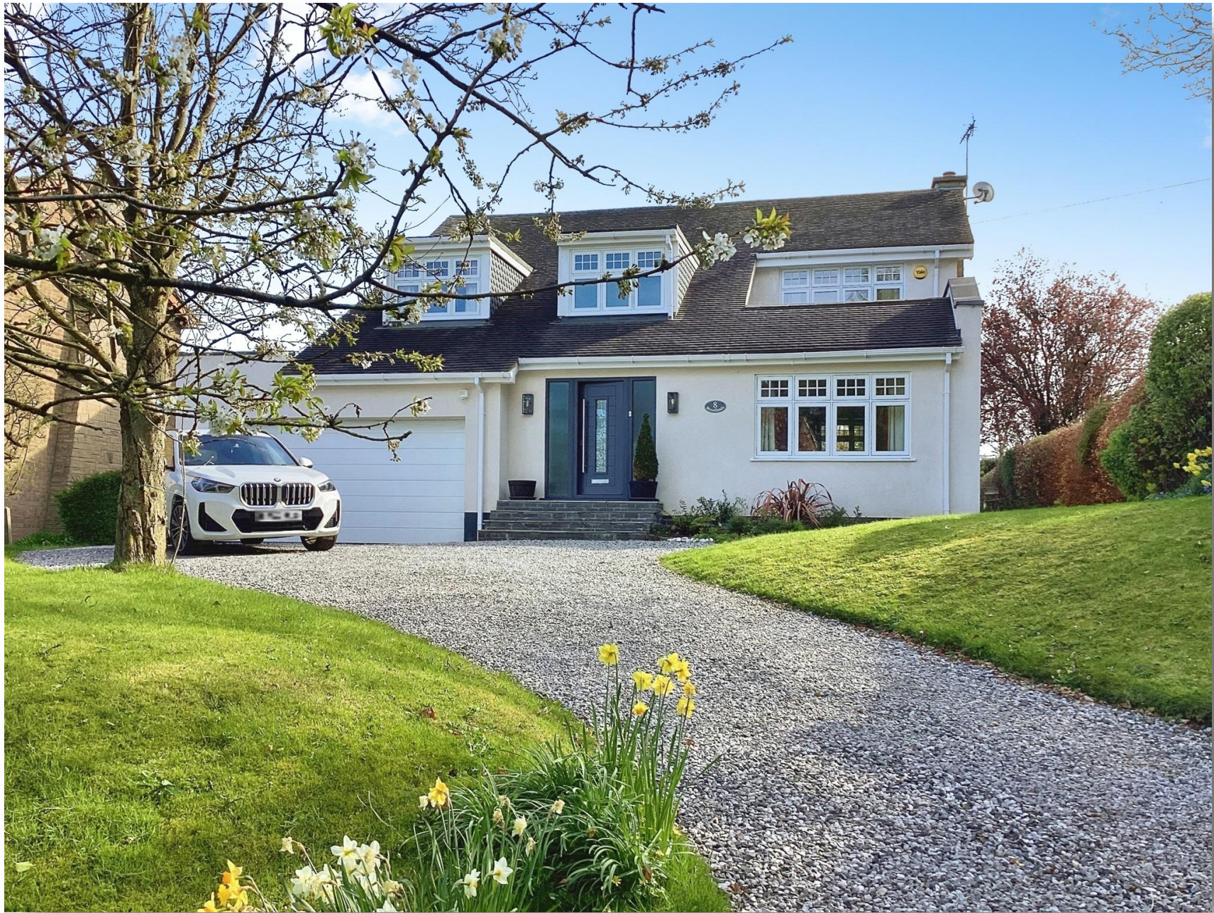
Howl Lane, Hutton, Driffield, YO25 9QA