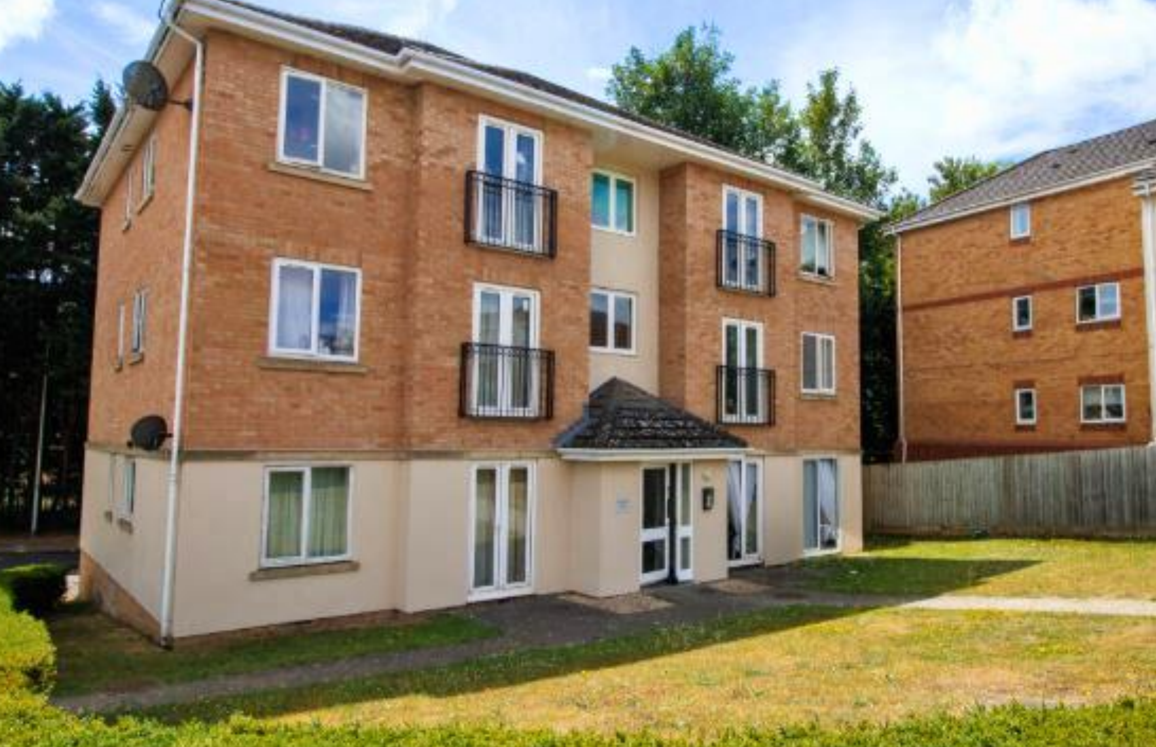
3 Tarn Howes Close, Thatcham, Berkshire RG19 3TS