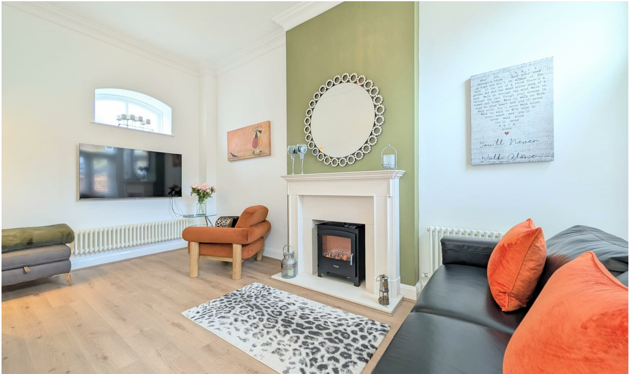
GOLF | CHARLOTTE HOUSE, GROUND FLOOR, 35-37 HOGHTON STREET, SOUTHPORT, MERSEYSIDE, PR9 0NS