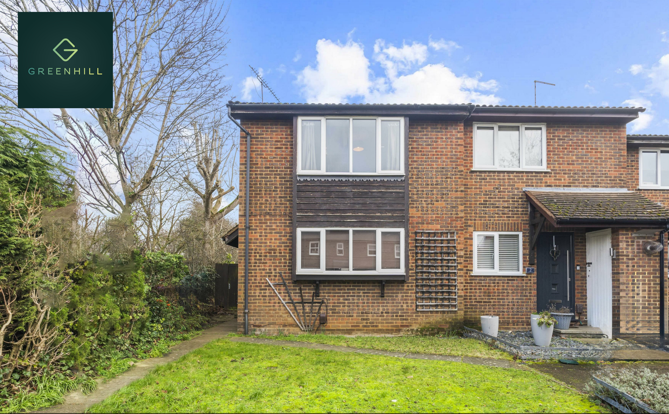
Turpins Close Hertford, SG14 2EH Guide price £425,000