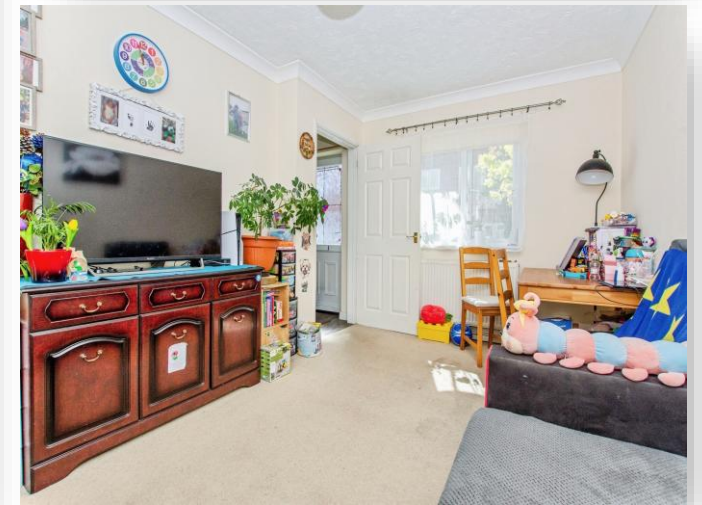
Trafalgar Court, Wisbech PE13 3BP