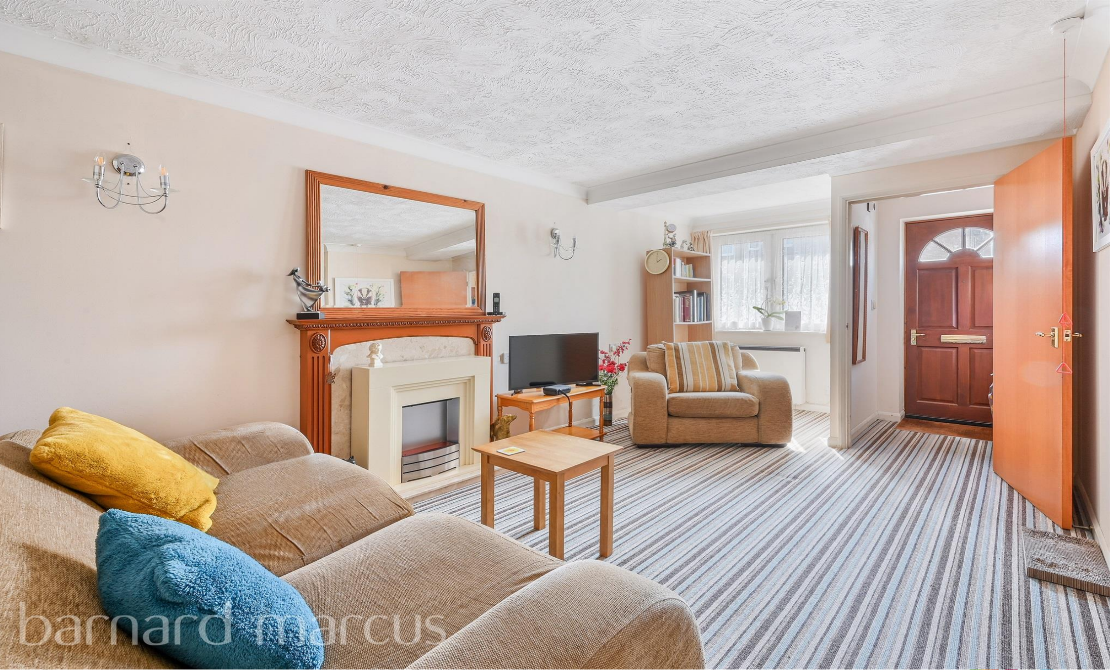
Badgers Lodge, The Grove, Epsom, KT17 4JU