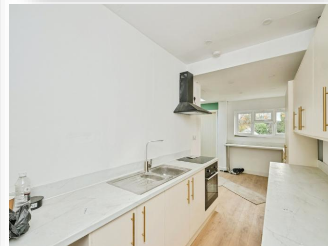
Harden Road, Harden Walsall WS3 1EN