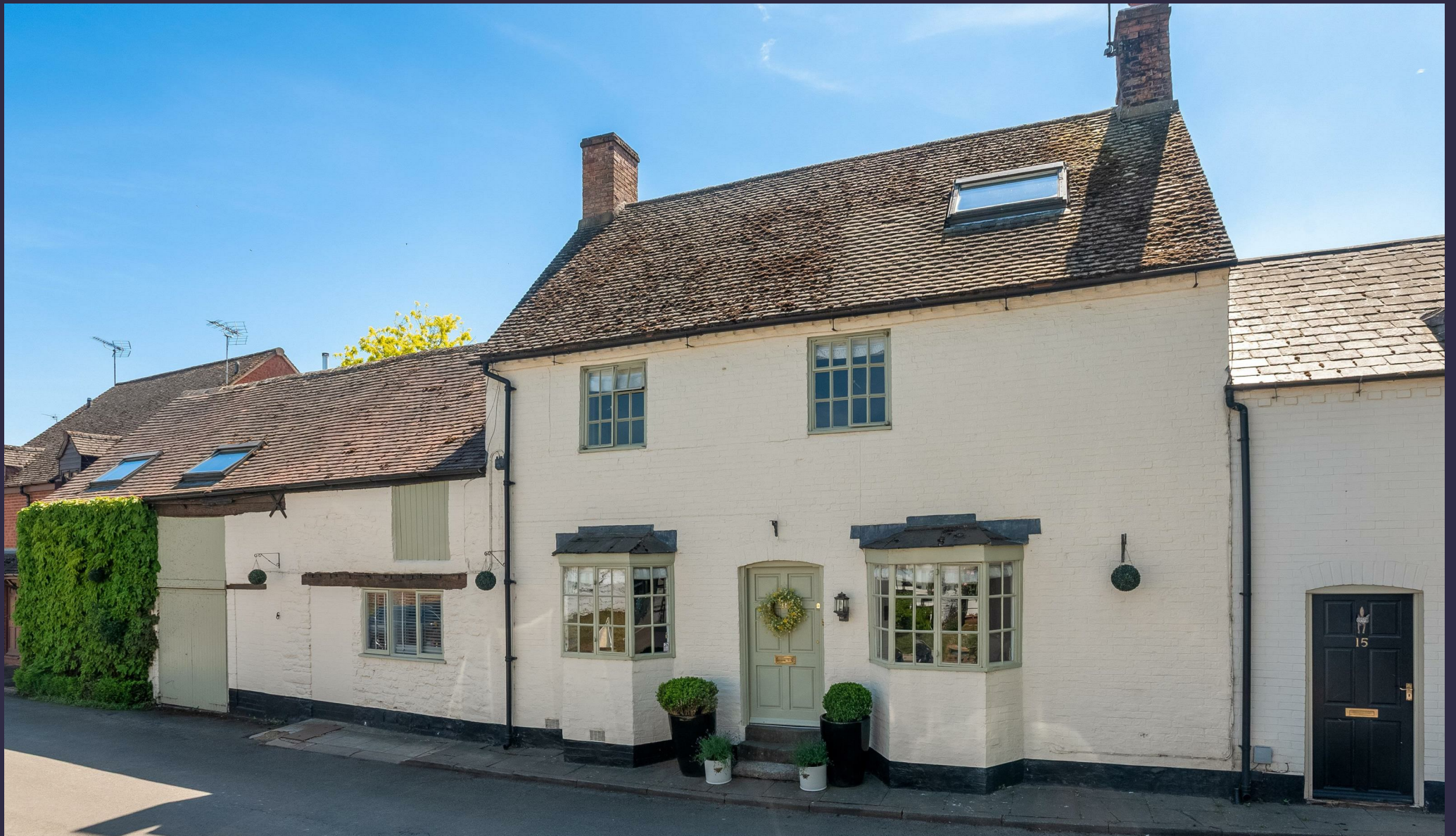
Stour House, 11 Watery Lane, Shipston-On-Stour, Warwickshire, CV36 4BE