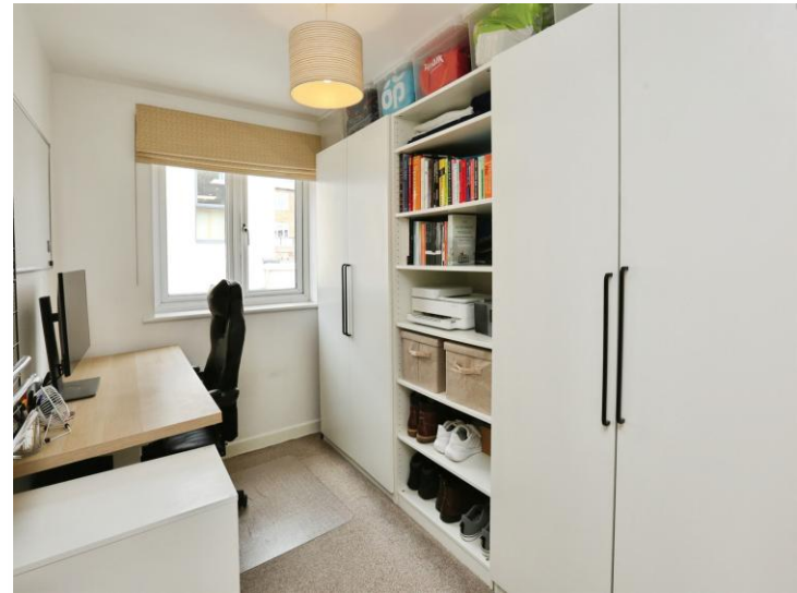
Clarke's Court Quay Street, Fareham PO16 0LE