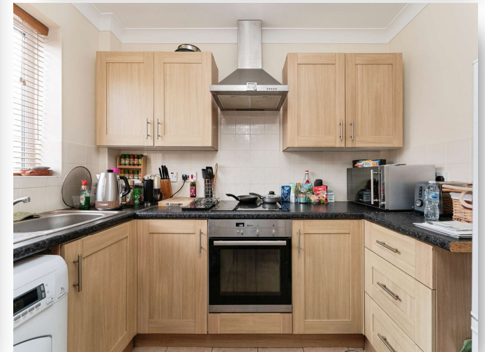
Annabelle Avenue, Manea March PE15 0HX