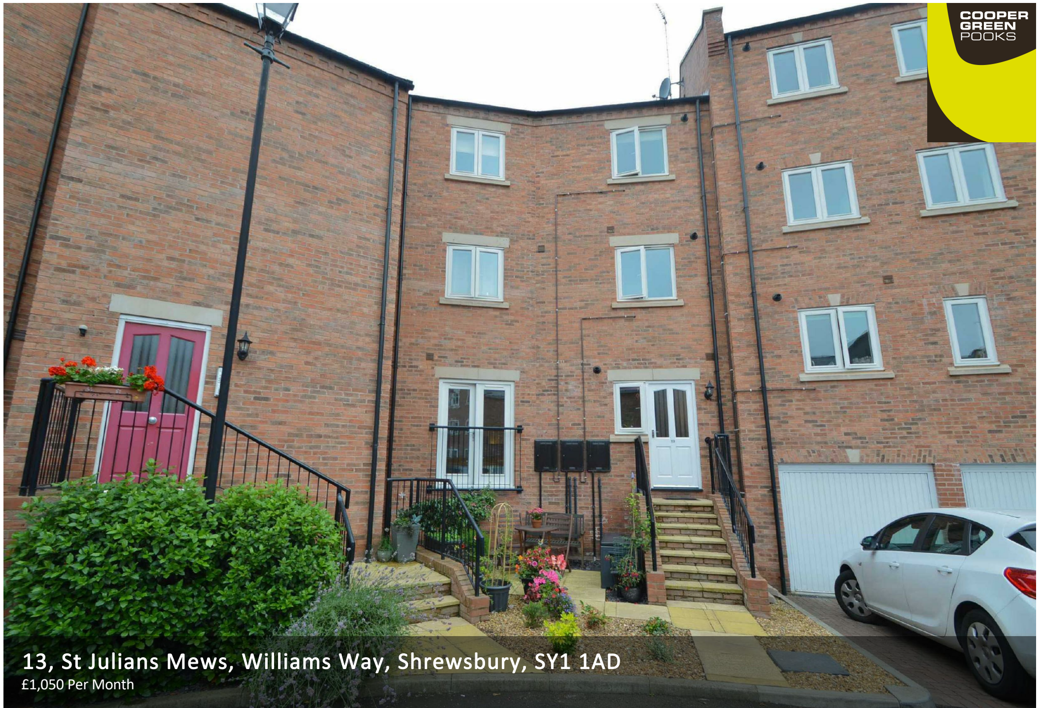
13, St Julians Mews, Williams Way, Shrewsbury, SY1 1AD £1,050 Per Month