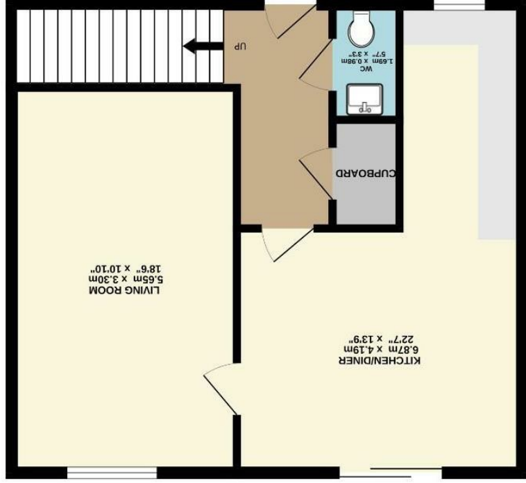
GROUND FLOOR 51.5 sq.m. (554 sq.ft.) approx.

TOTAL FLOOR AREA : 99.0 sq.m. (1066 sq.ft.) approx.