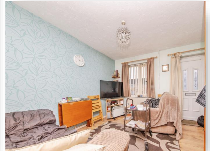
Yew Tree Rise, Pinewood, Ipswich, IP8 3RJ