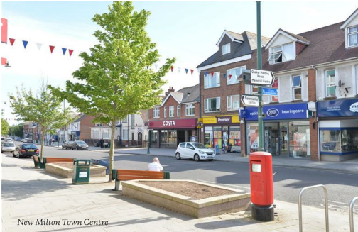
New Milton Town Centre

A block-paved central parking area provides parking for the residents.