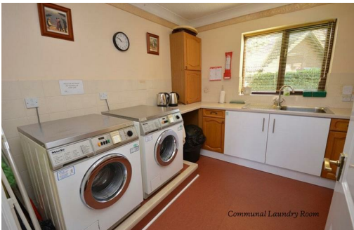
Communal Laundry Room