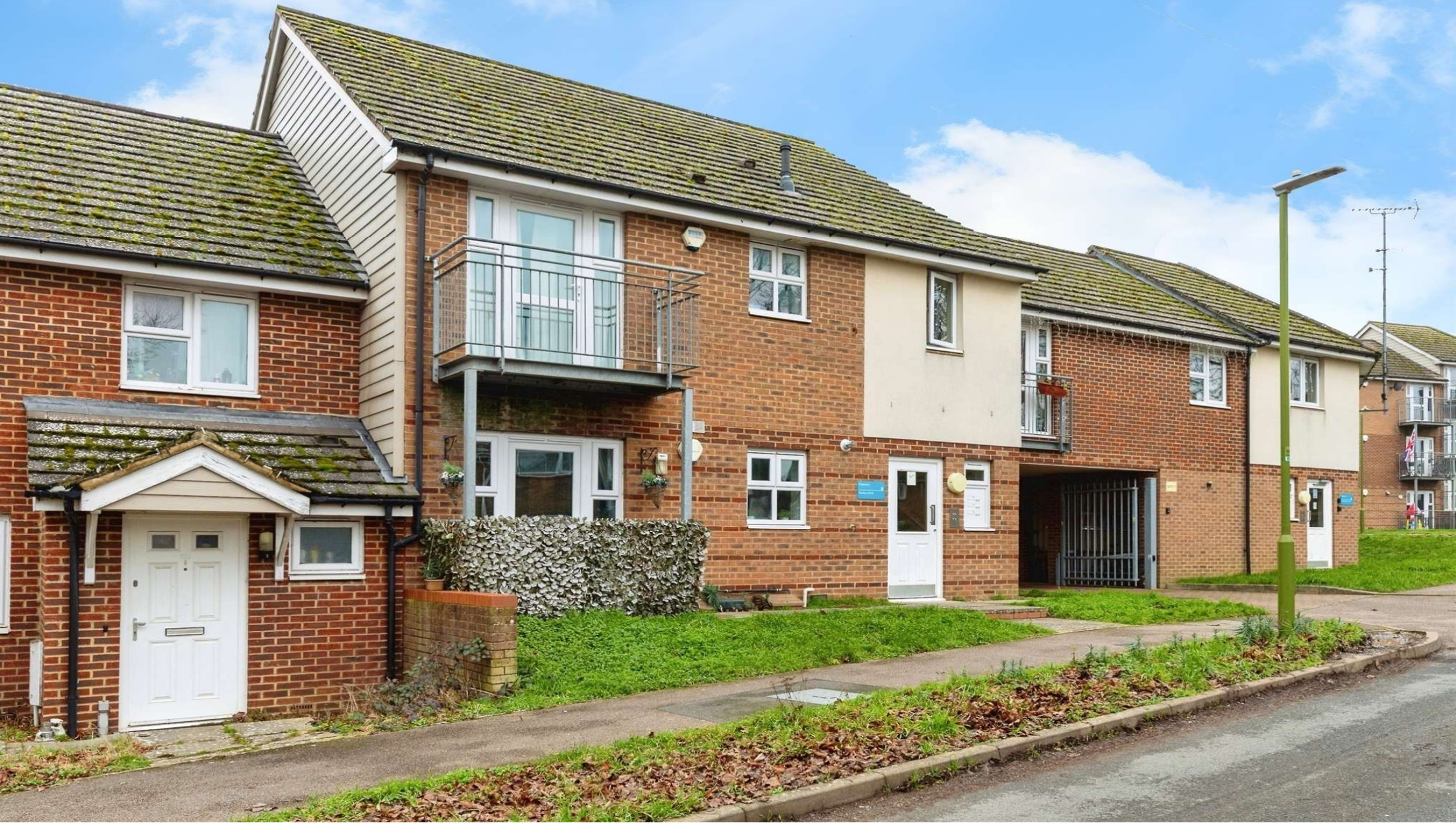
Claymores, Stevenage, SG1 3TL