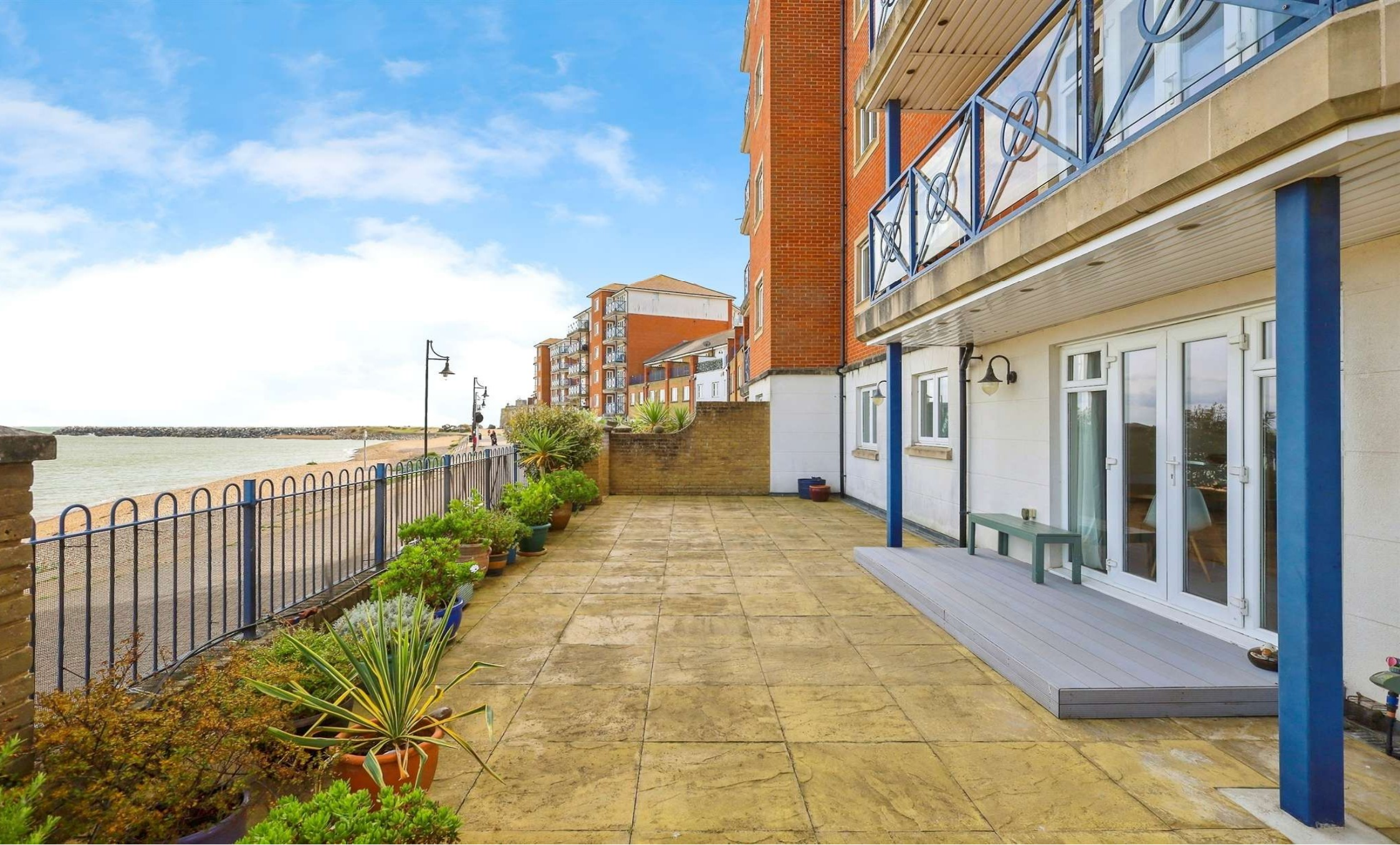
Dominica Court, Eastbourne BN23 5TR