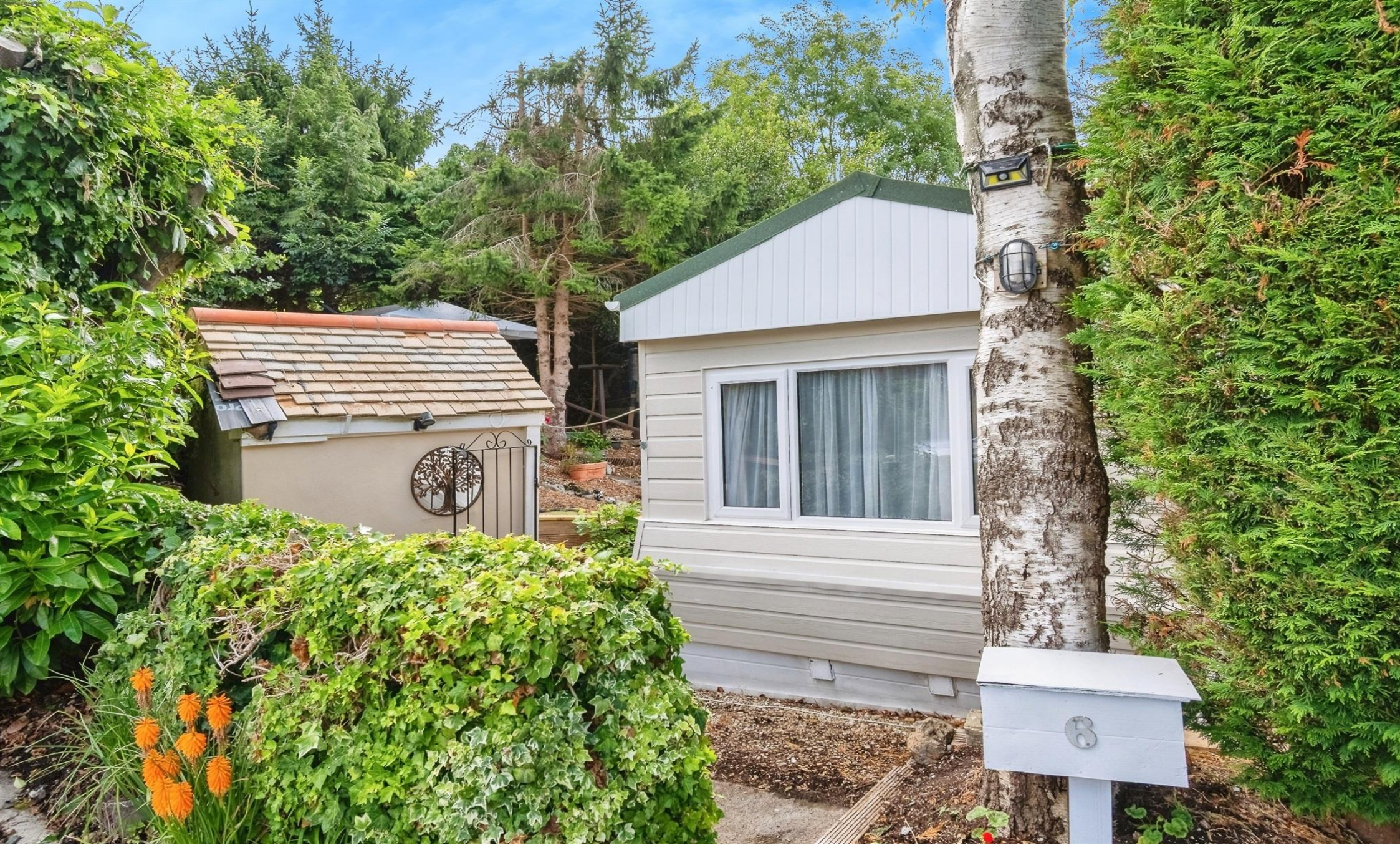
Quarry Rock Gardens, Bath BA2 6EF