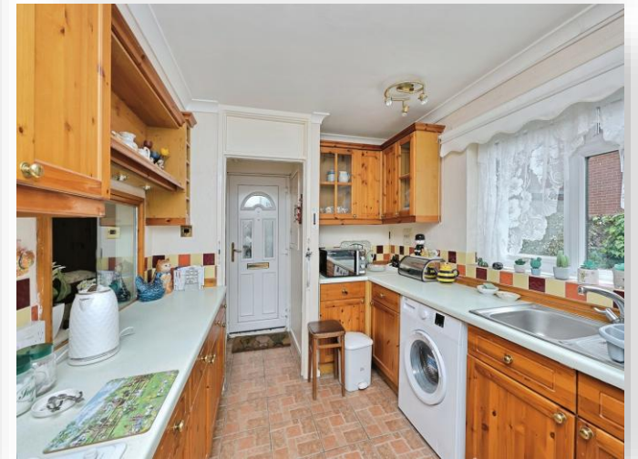
Hauteyn Court, Norwich, NR3 2RQ