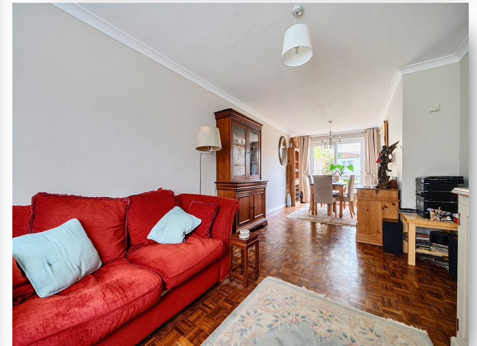
3 Fawley Close, Maidenhead SL6 7UP