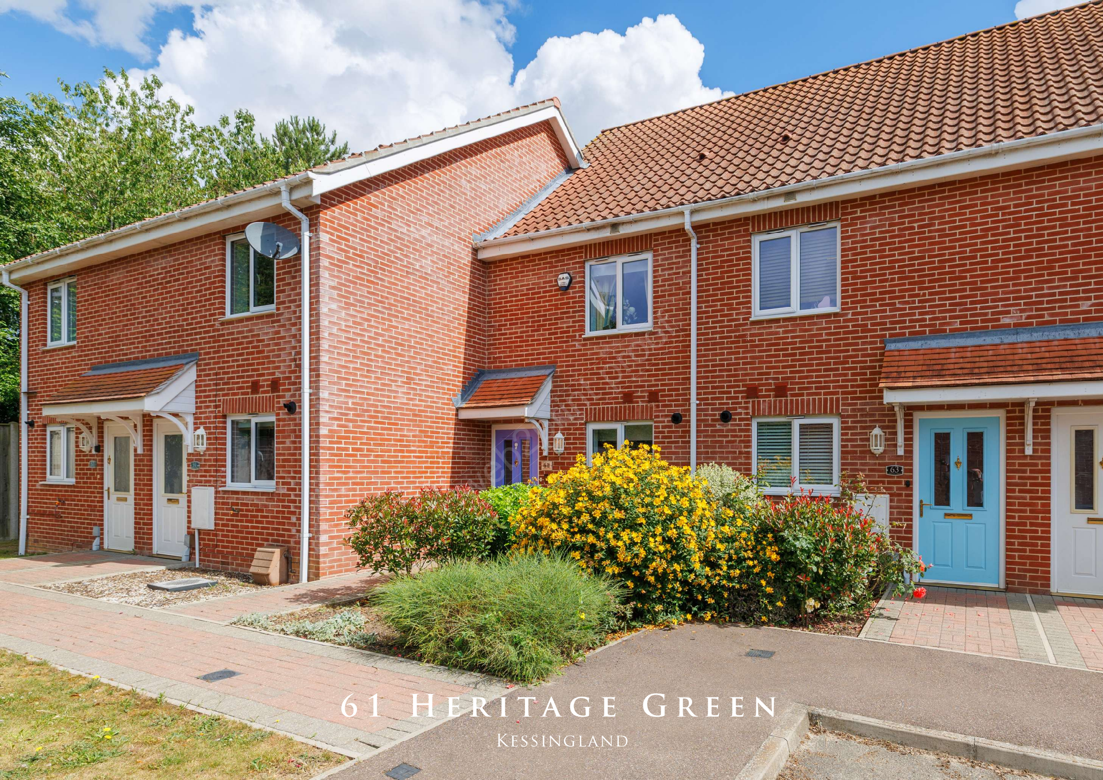
61 HERITAGE GREEN KESSINGLAND