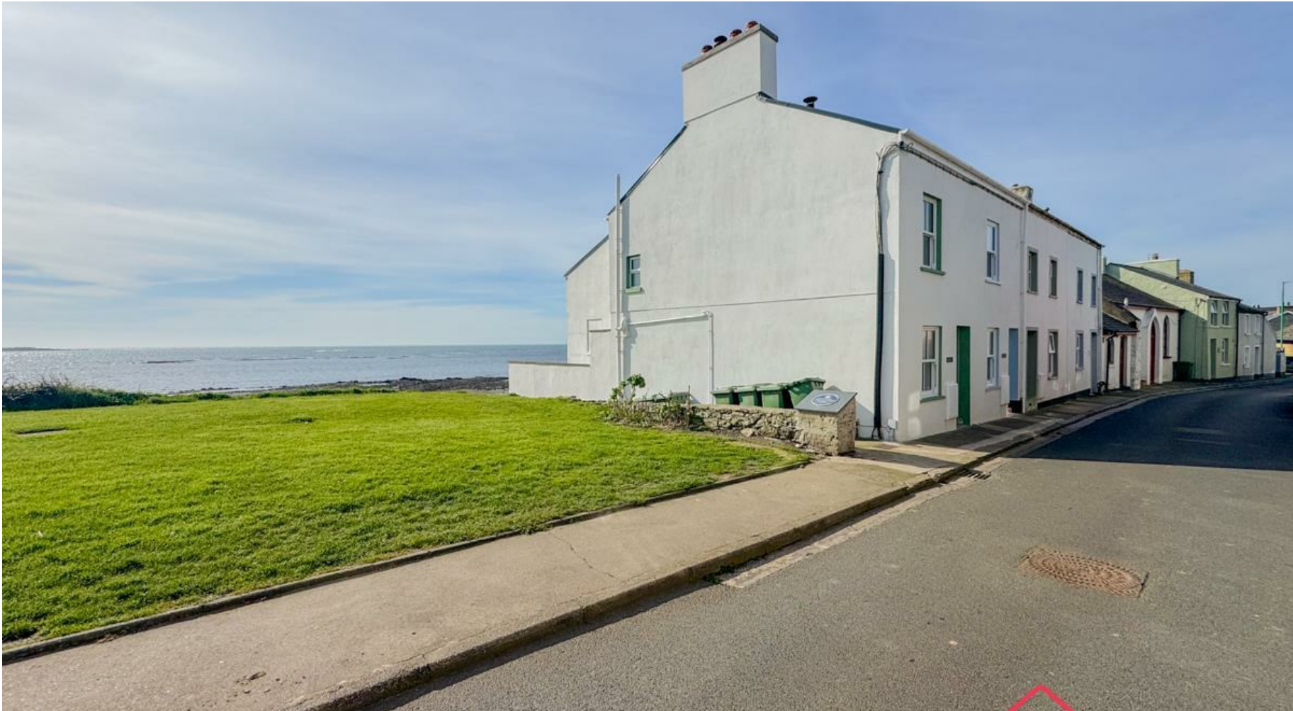
41 Queen Street, Castletown, Isle Of Man, IM9 1PA Asking Price £425,000